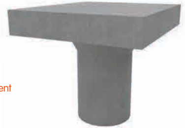
TAB ® Structural