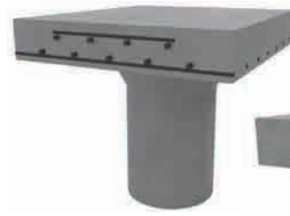
Slab on piles with traditional reinforcement

TAB ® Structural solutions can be designed for slabs on piles with or without pile heads thanks to the high punching shear resistance of the steel fibre reinforced concrete used.